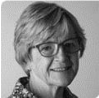
Baroness Hilary Armstrong