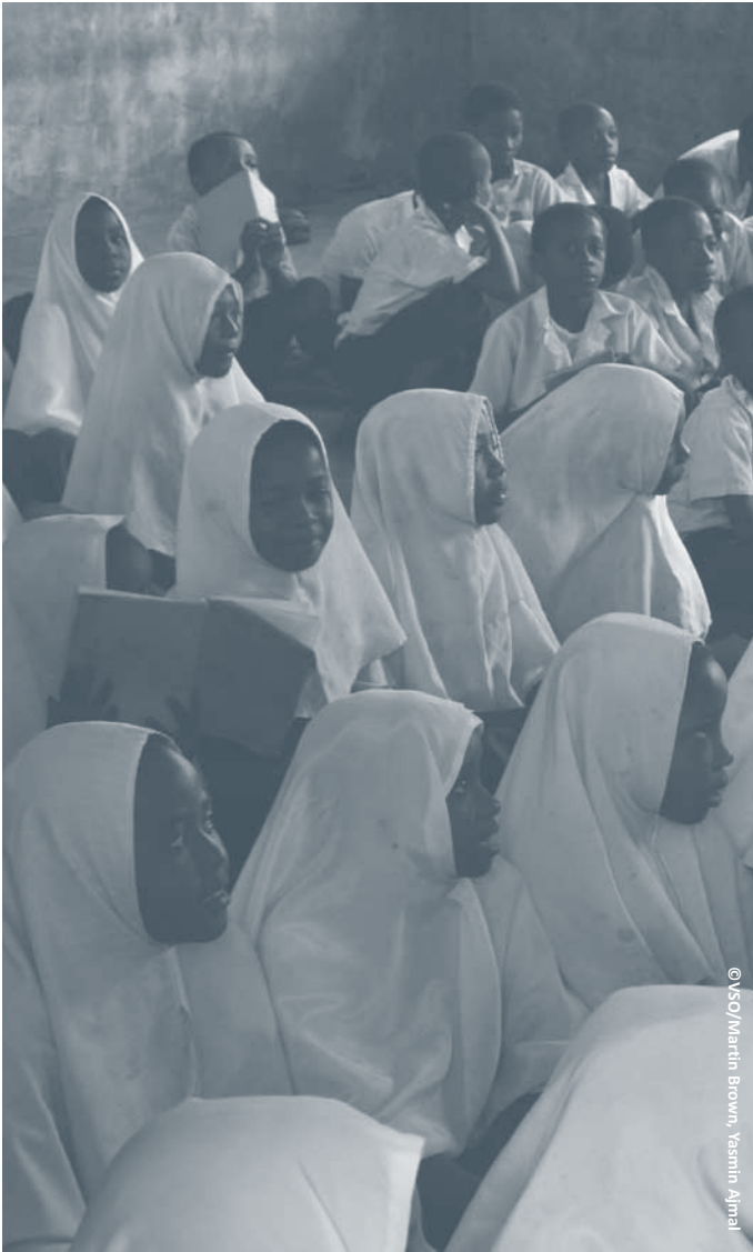
Participants highlighted the challenges of creatively teaching large classes with very limited resources such as this class from Fuoni Primary School.

“We need to be linking the head teacher, the TCs and the Inspectors [for recognition of training needs].”