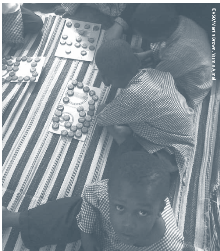
Children at nursery learn using low/no cost materials.