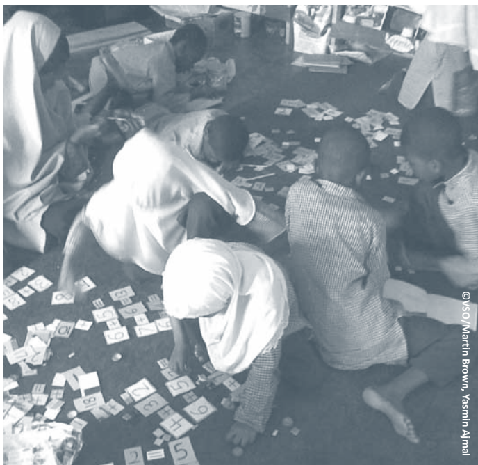
Children at a pre-school madrassa where the ethos has moved towards exploratory learning using school-made materials.

It may be interesting to work with an NGO to develop a training scheme using experienced head teachers from the UK (eg on one-month sabbaticals) to deliver specific training needs. Although any foreign head teacher involved would have no experience of Zanzibari schools, they would have experience in leadership and could possibly work with two or three school leaders here over a short space of time. A regular forum could be set up for evaluating the training and the impact on practice.