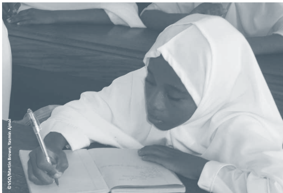
Students at Vikokotoni Secondary School where the headteacher devised a ‘5 Pillars of learning’ structure to promote exam success.

There is also a sense among some teachers and head teachers that status is affected because some head teachers lack academic qualifications: “Head teachers must be more highly qualified than teachers, to give them respect and status” (Female secondary head teacher, from an urban school). Since salaries in Zanzibar are determined according to academic qualification, there are frequent cases where the head teacher earns less than some of his or her staff. Lack of academic qualifications thus severely undermines status, and consequently authority, in school.